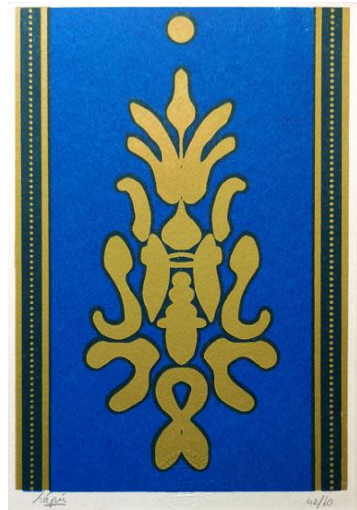
'Wallporn' (blue): silk-screen print, H:30 cm x W:21 cm, Edition of 60