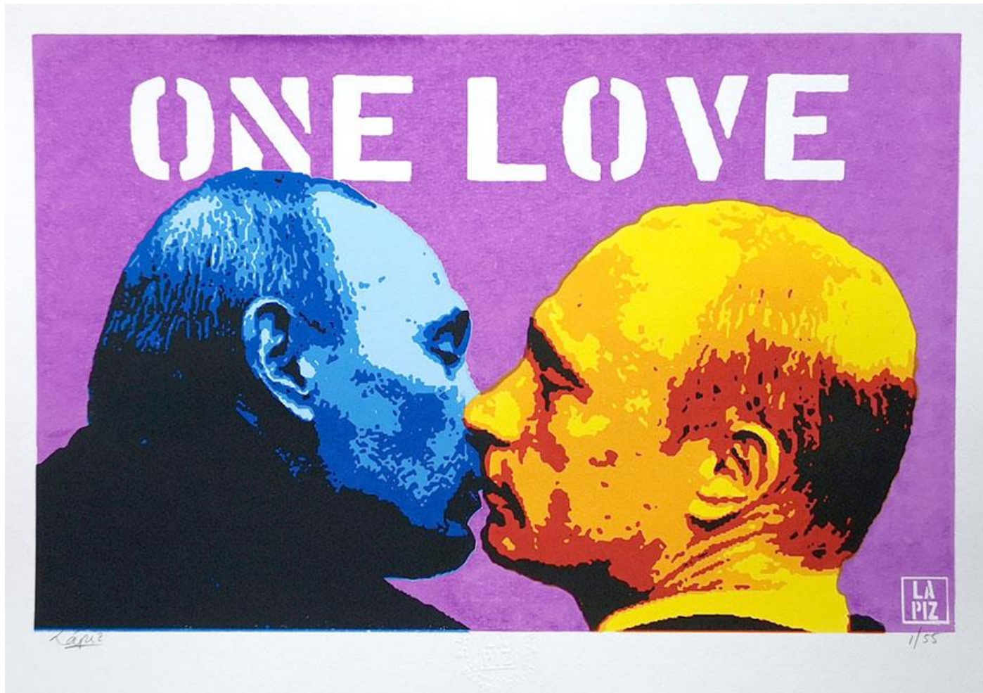
'One Love' : silk-screen print on paper, H:30 cm x W:42 cm, Edition of 55