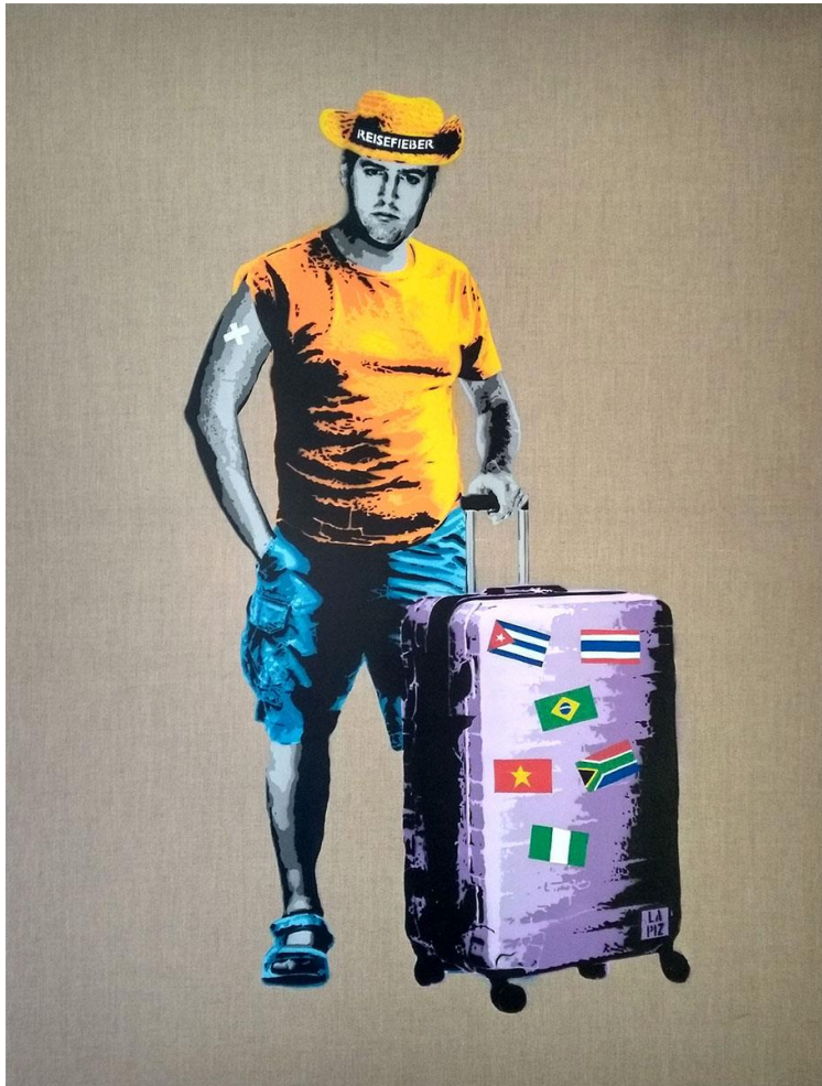
'Reisefieber/Travel fever': Aerosol on canvas, marker pen H: 130 cm x W: 100 cm