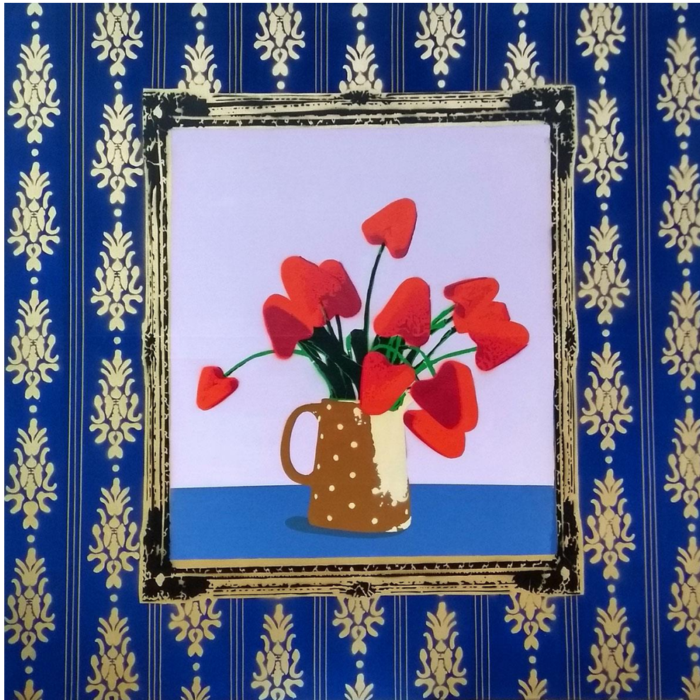
‘Stillleben/Still love’ : Aerosol and acrylic paint on canvas, H:125 cm x W:125 cm