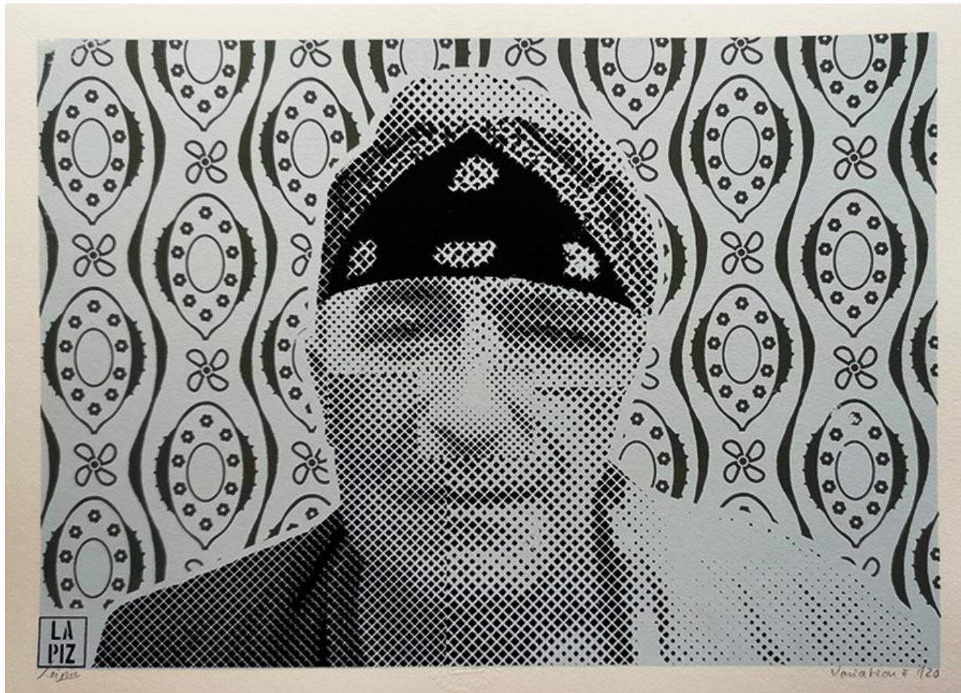
'Gesichter der Veddel / Faces of Veddel (Variation-F)' : silk-screen print on paper, H:30 cm x W:42 cm, Edition of 20