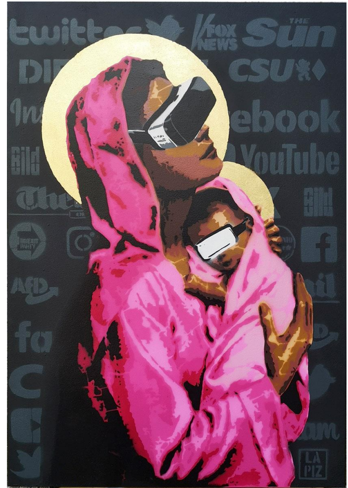
'Propaganda': Aerosol on wood panel, acrylic paint, 24 carat gold H: 100 cm x W: 70 cm