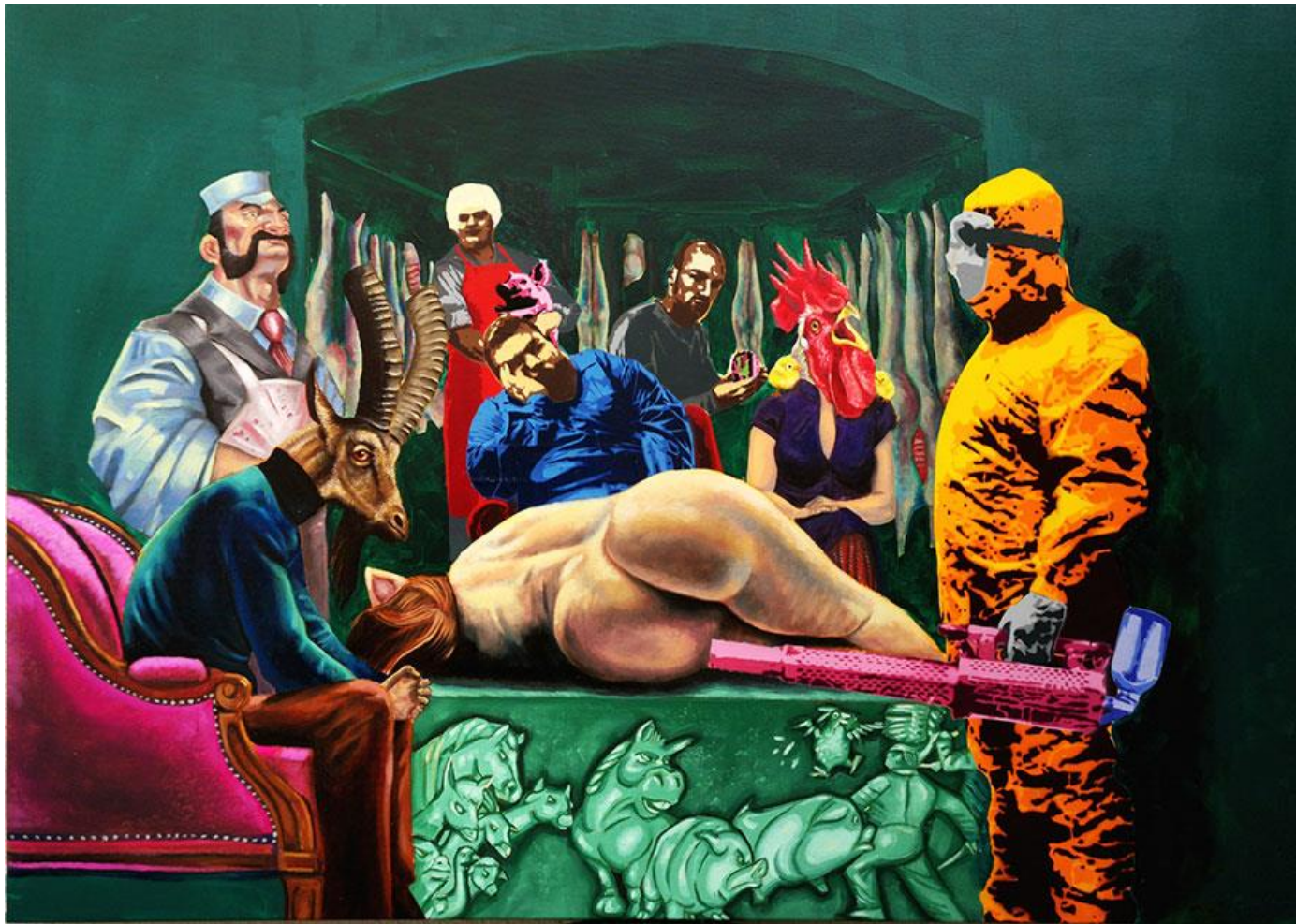
Thea Lang Collective: 'Komm auch du schau zu /Come take a look' Oil, aerosol on canvas , H: 100 cm x W: 140 cm