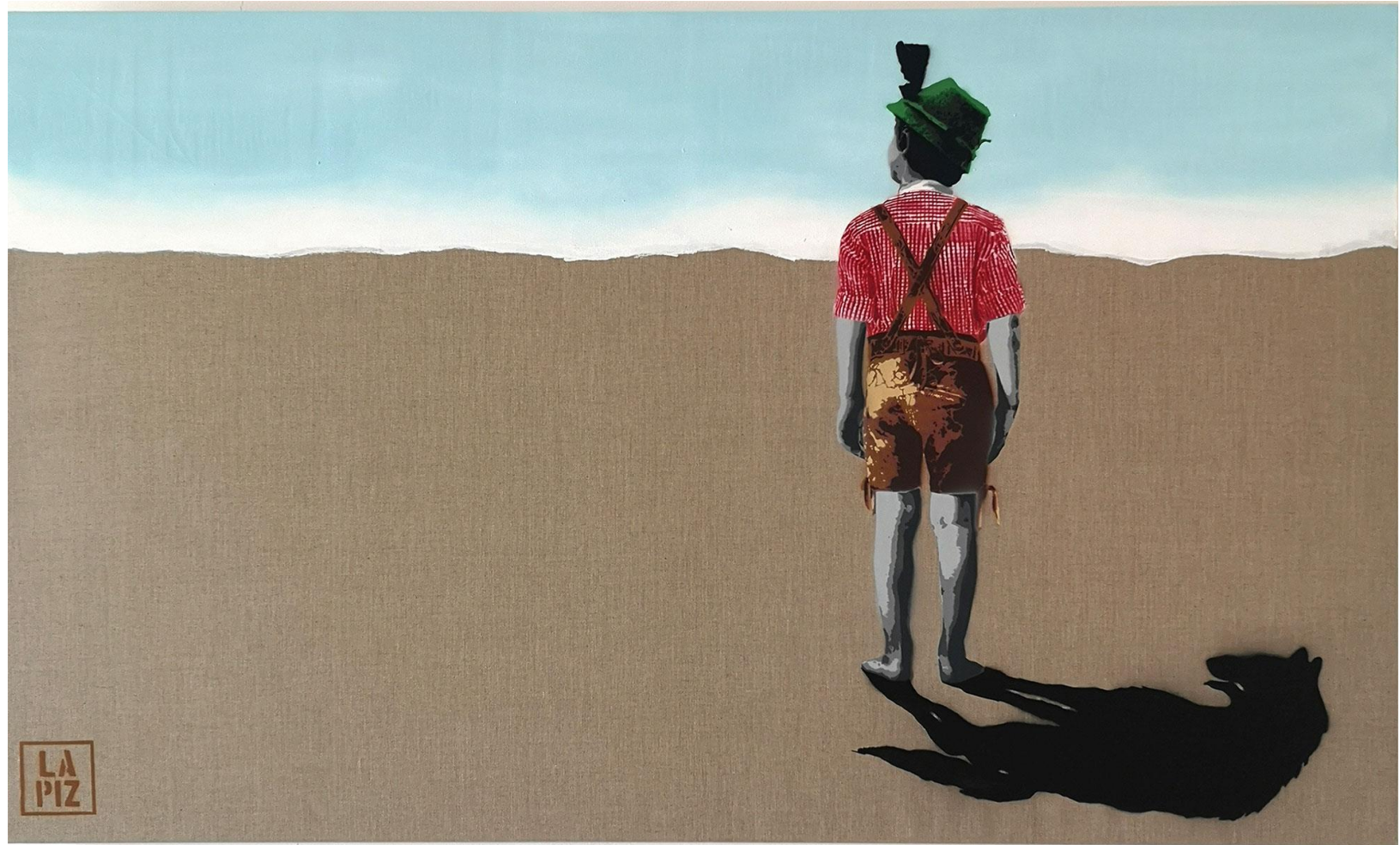
'Wolfsgang': Aerosol, Acryl on canvas, H: 120 cm x W: 200 cm