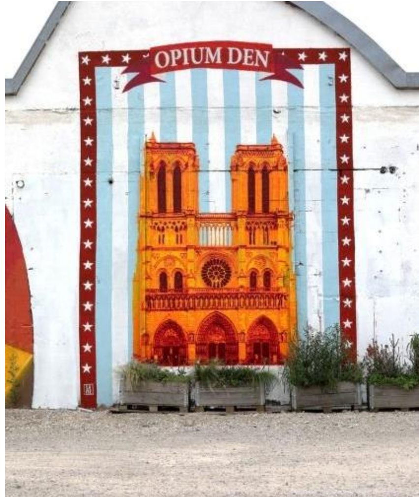
'Opium Den': Munich, Germany.