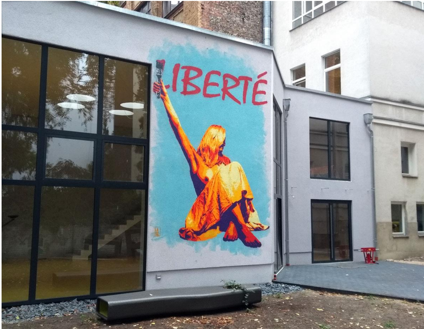
'Liberté': Berlin, Germany.