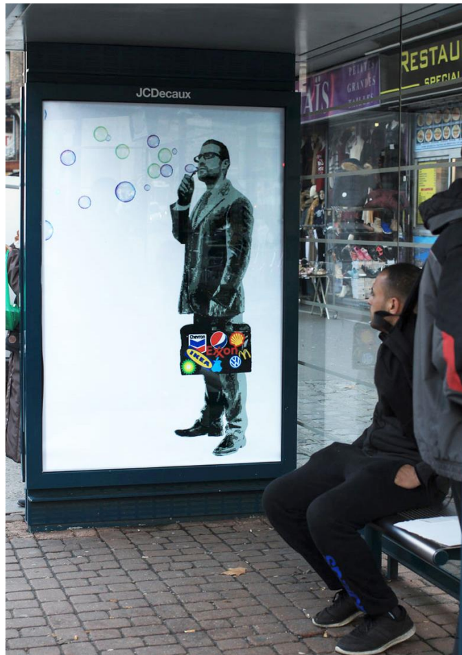
'Corporate Bubbles': Paris, France.