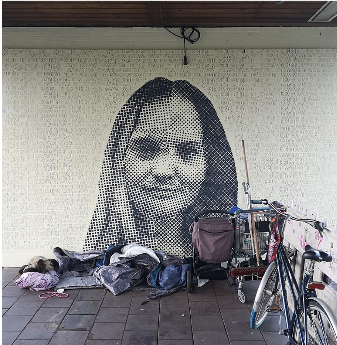
'Faces of Veddel' Metro Station Veddel, Hamburg, Germany.