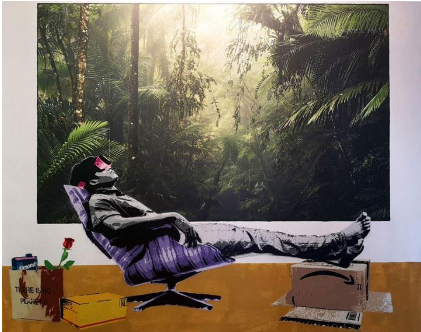
'Planet B': Munich, Germany.