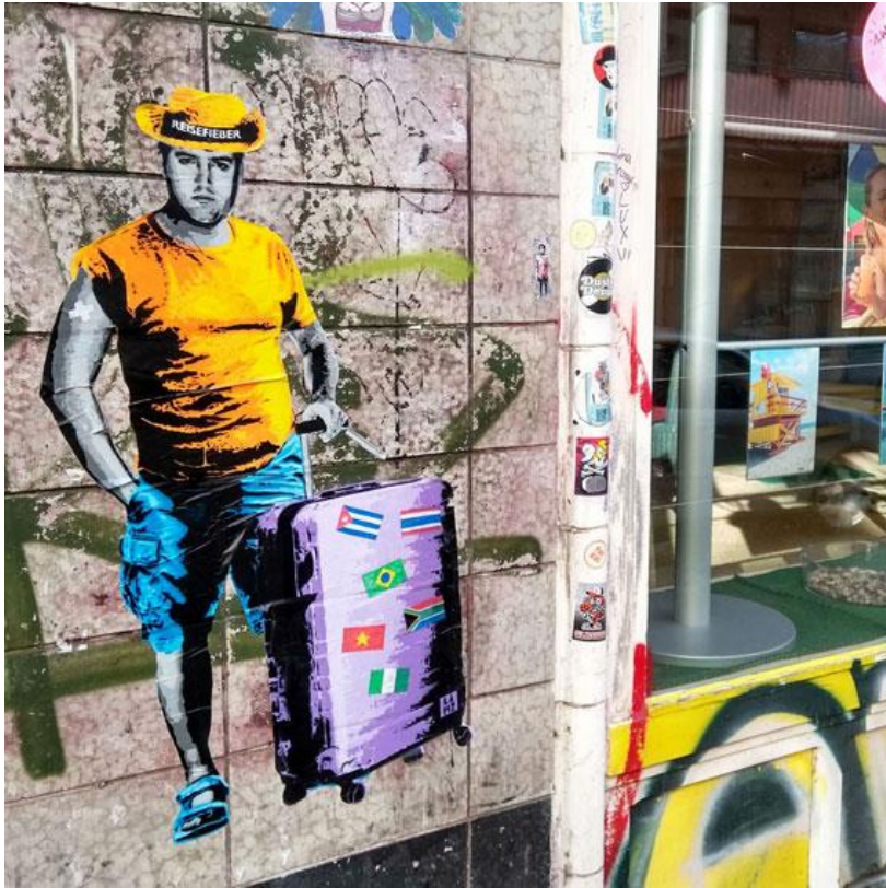
'Reisefieber / Travel Fever': Hamburg, Germany.