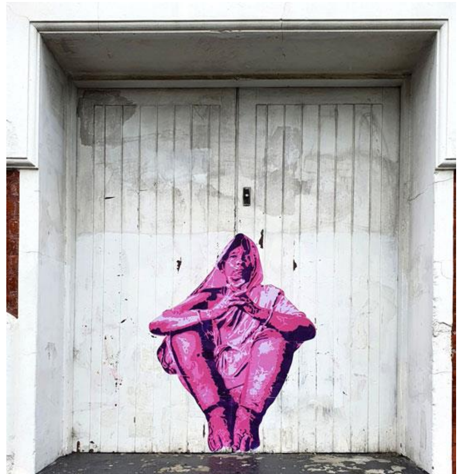
'Elephantiasis': Dunedin, New Zealand.