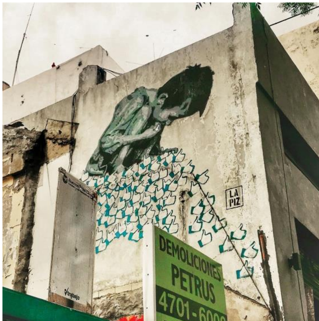
'Likes don't feed': Buenos Aires, Argentina.