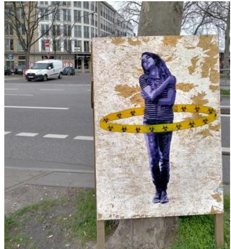
'Life in Time of Corona': Hamburg, Germany.