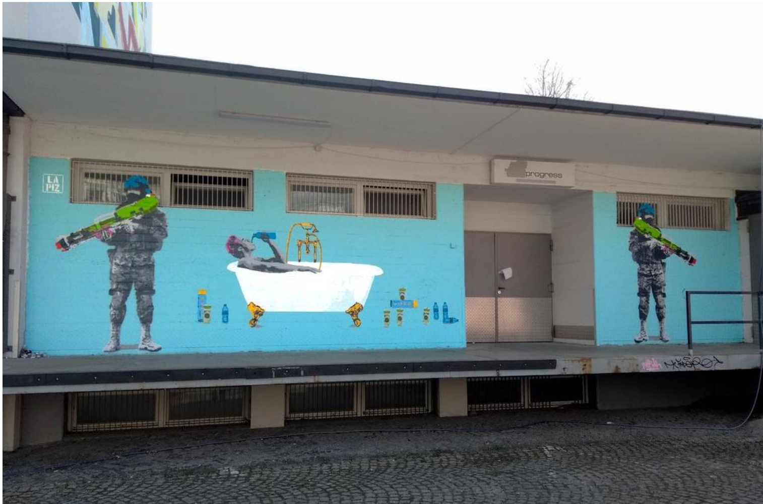
'Water is a human right': Munich, Germany.