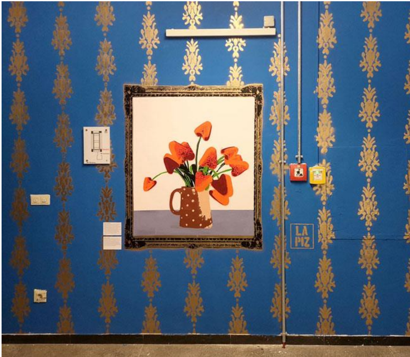
'Stillleben / Still Love': Munich, Germany.