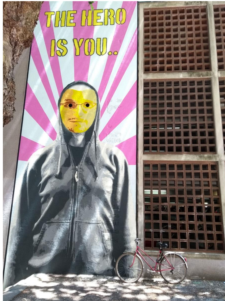
'The Hero is you': Grenoble, France.