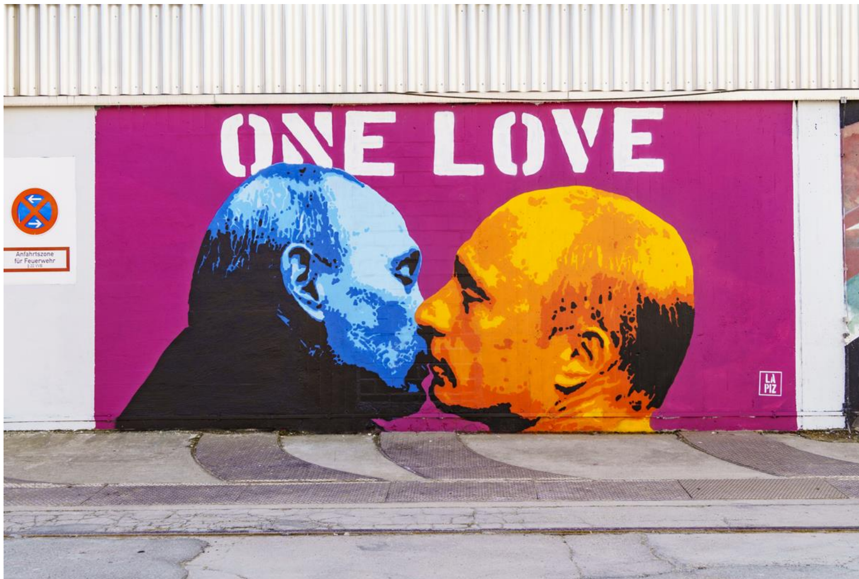
'One Love': Munich, Germany.