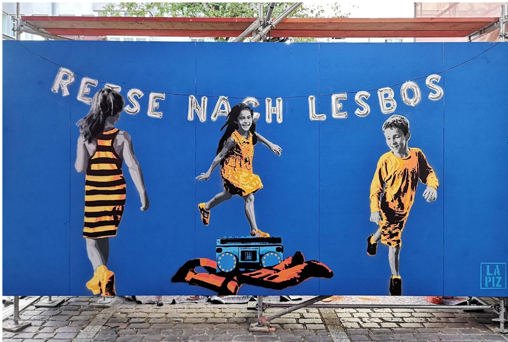
'Reise nach Lesbos (Travelling to Lesbos)': Berlin, Germany.